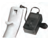
Part No. 2910012 eVol® Universal Charger