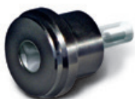
Single-channel adapter for pipettes with tip