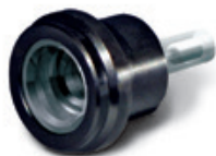
Single-channel adapter for pipettes without tip