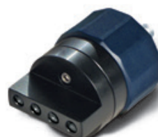
Multichannel adapter for pipettes with and without tip