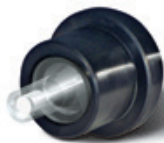
PE filter in single- and multichannel adapters