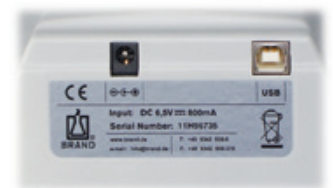
Back of the instrument with AC adapter socket and USB port